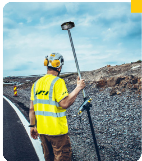
Xsite® PAD uses the LANDNOVA X 3D software offering a full support for model based workflow.

Xsite® PAD's rugged and accurate smart GNSS antenna comes with tilt compensation, so you'll be able to make precise measurements even with a tilted rod.