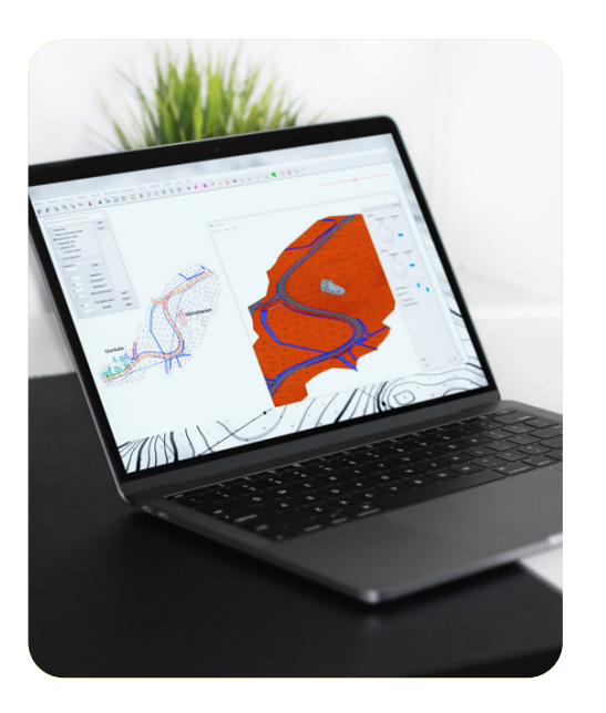
3D-Win software is only available in Finland. Contact our experts for alternatives available on your market.

Thanks to the comprehensive inspecting, editing, and calculation features, 3D-Win suits the needs of various industry professionals.